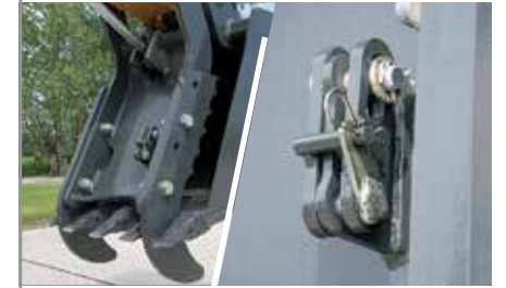
THUMB AND THUMB LOCK