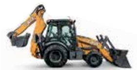
590 Super N