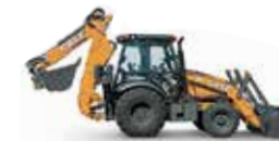
580 Super N Wide Track