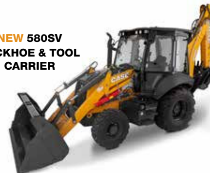
NEW 580SV BACKHOE & TOOL CARRIER