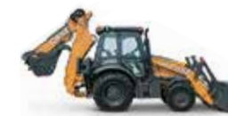
580 Super N