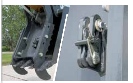
THUMB AND THUMB LOCK