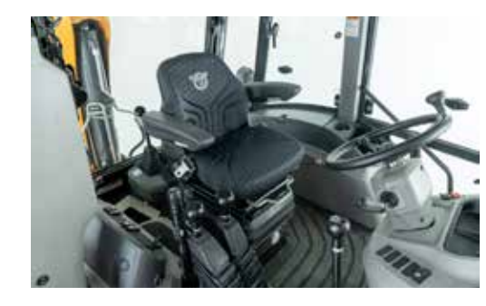
COMFORT. EASE. VISIBILITY Big cab delivers a truly operator-first experience.