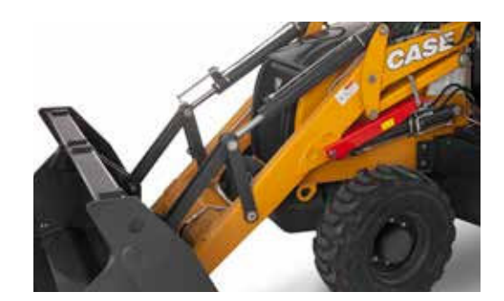
HANDLING WITH CONFIDENCE The tool carrier loader design provides greater

The tool carrier linkage is ideal for those who use the loader end of their backhoe as a primary material handler – loading and unloading pallets, moving pipe and other bundled material around the yard. The tool carrier linkage also delivers excellent loader lift capacity and bucket breakout force. Adding a 4-in-1 bucket, a 6-in-1 bucket, or any of the countless attachments available for CASE backhoes turns this into a multi-purpose, jobsite-owning beast.