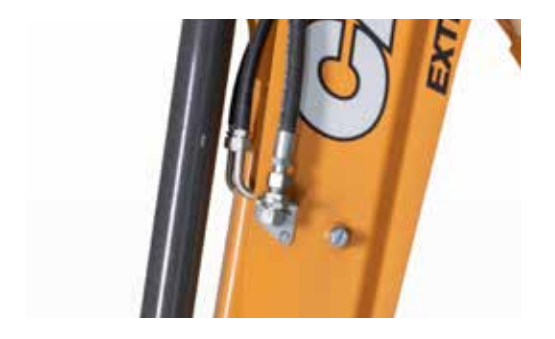
ATTACHMENTS FOR DAYS 4-in-1. 6-in-1. 75-in-1. Countless bucket and attachment options let you do more with this machine.

Large cab, tool carrier design and lots of glass delivers excellent visibility.