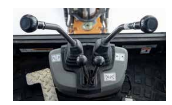
KEEPING WITH TRADITION 2-lever SAE pattern wobble sticks for optimal feel.

Whether your first backhoe or your 100th, the CASE Utility Plus delivers value and productivity that is both operator first and business smart.