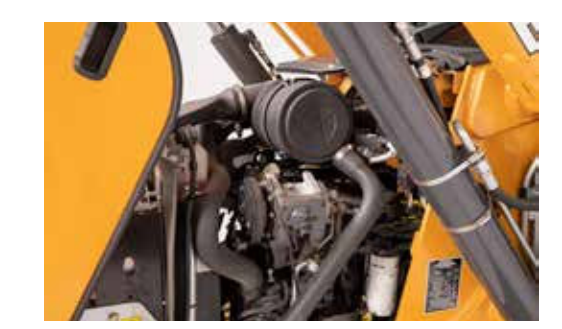
EMISSIONS SYSTEMS 74 horsepower engine. No DPF. No DEF.